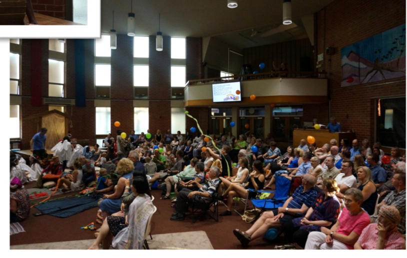
Celebrating the Happy Happy Day of Jesus birth!

Our wonderful Lighthouse Kids children who performed so well!