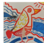
The Trinity in Colour Virginia Sharpley