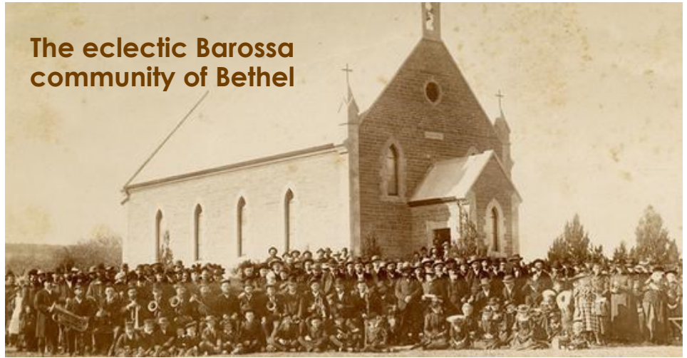
The eclectic Barossa community of Bethel

https://www.youtube.com/@friendsoflutheranarchives9644